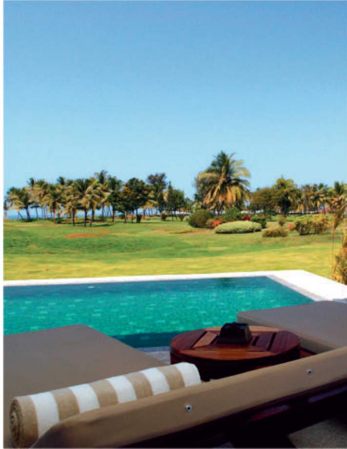
The Club Pool