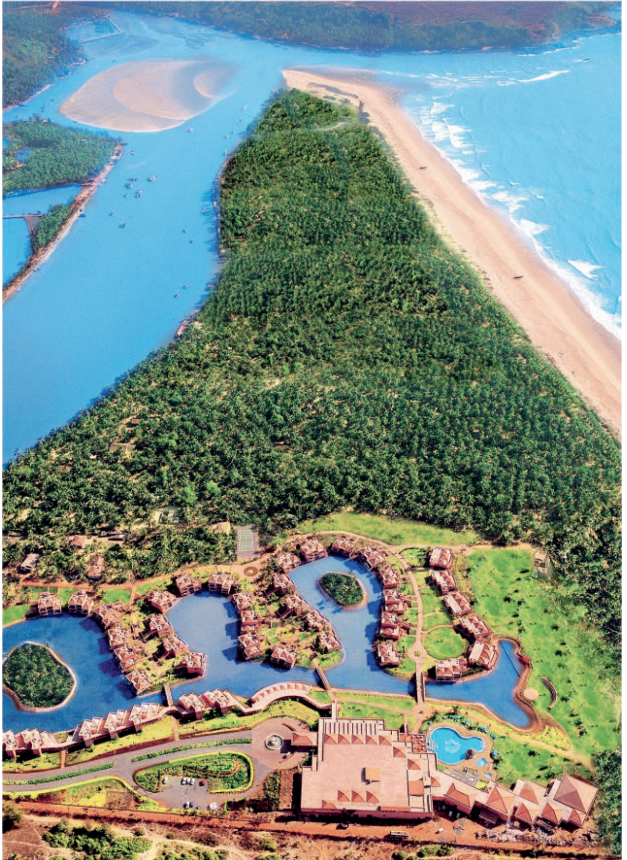
Aerial View - The Leela Goa