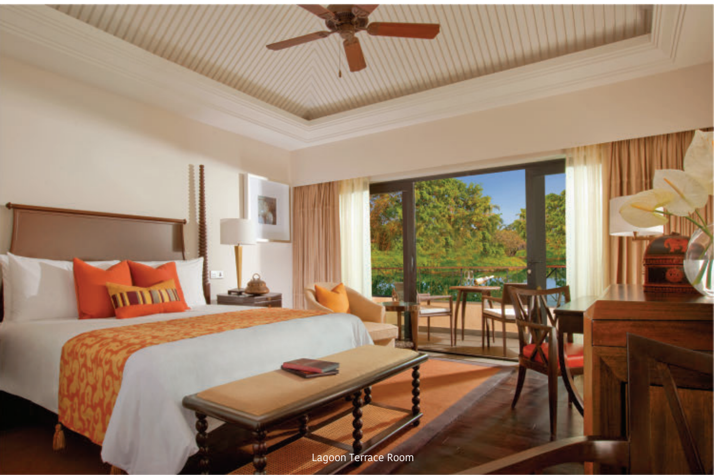
Lagoon Terrace Room